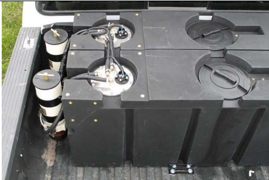
Trekker IOS System