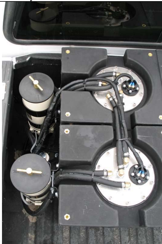
Trekker IOS System – Racor Filters and One Shot Pump