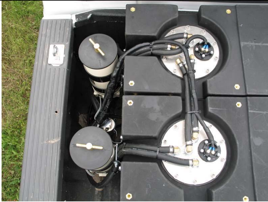
Trekker IOS System – Racor Filters and One Shot Pump