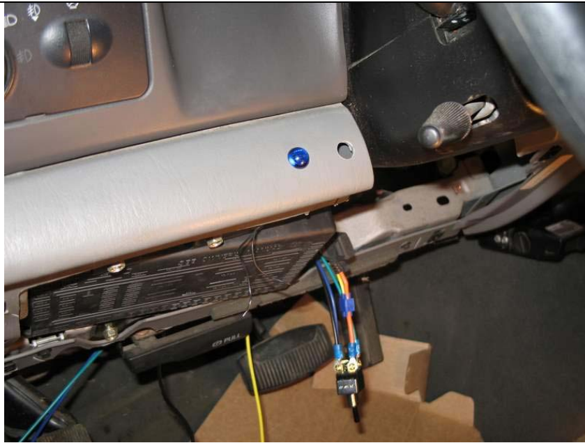
Toggle Switch and Optional LED Indicator