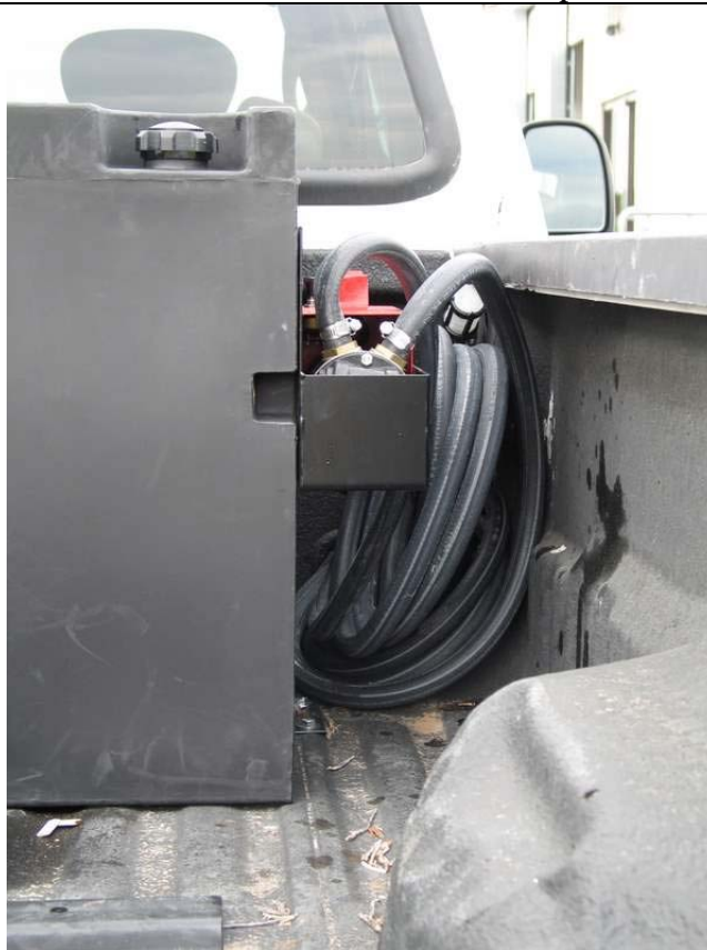
Collection and Transfer Pump