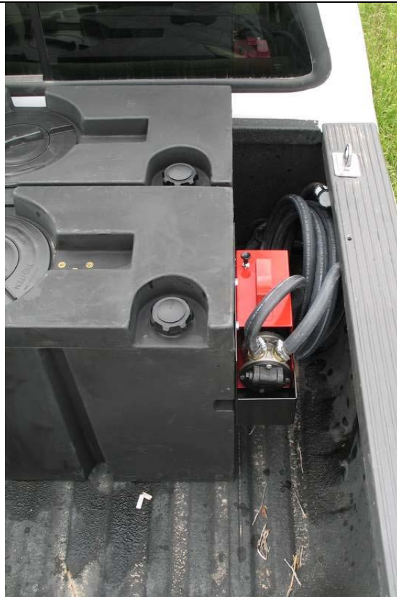
Trekker IOS System – Fuel Collection and Transfer Pump