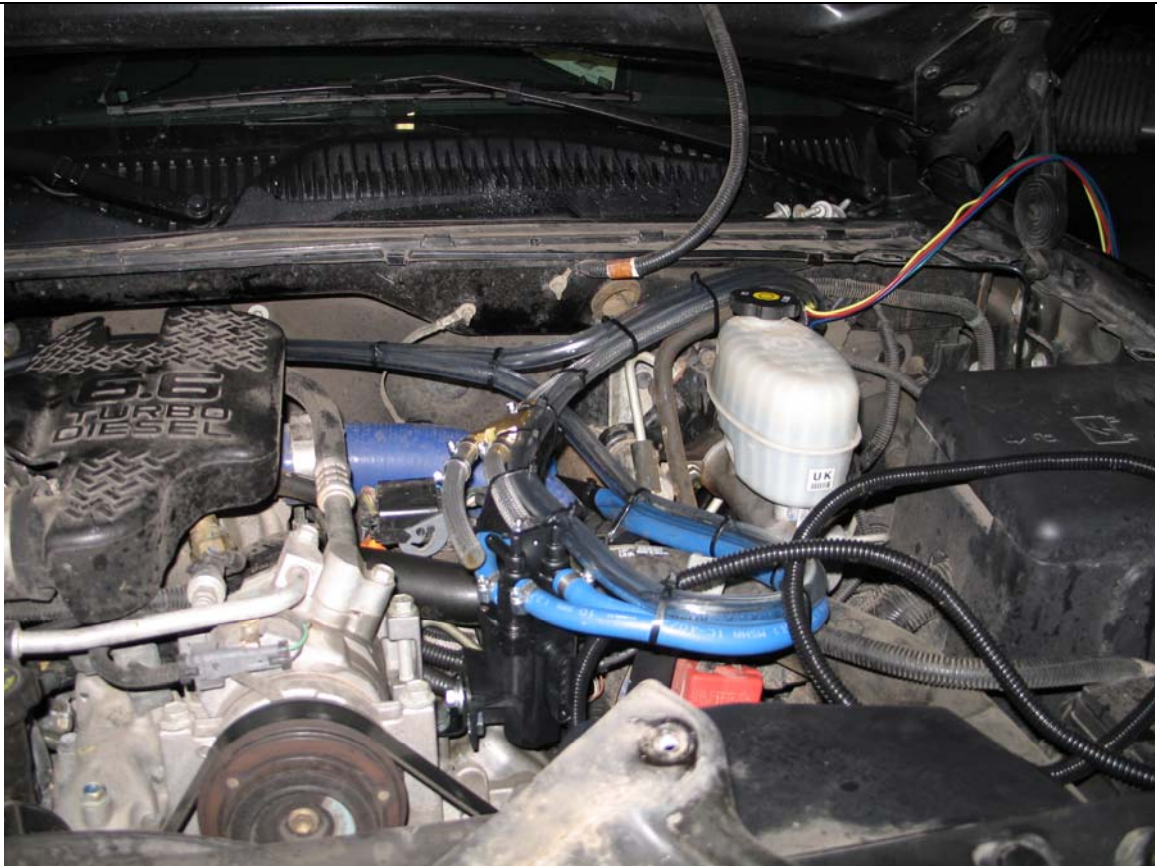
Pollak Mounted in Engine Compartment