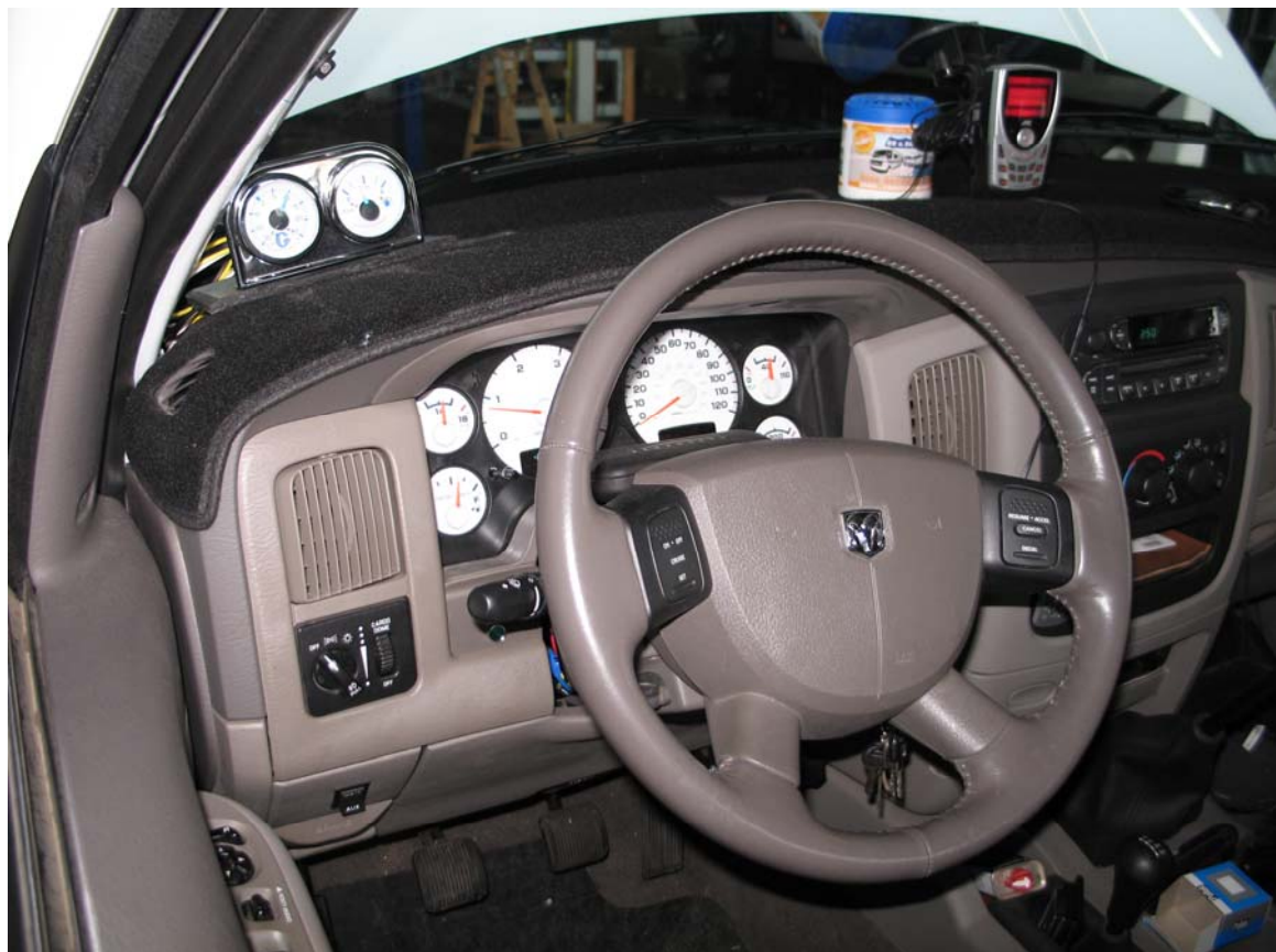
2003 Dodge Cummins – Standard Bracket Mount