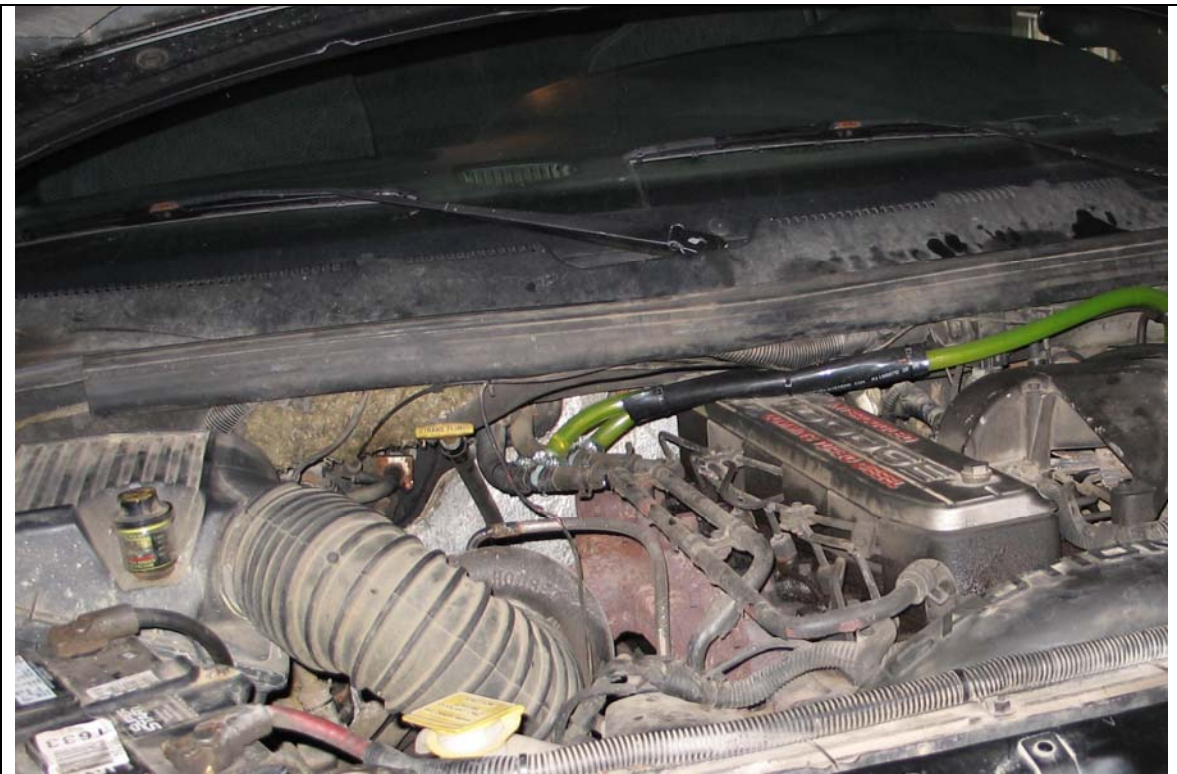
Coolant Tee Splice