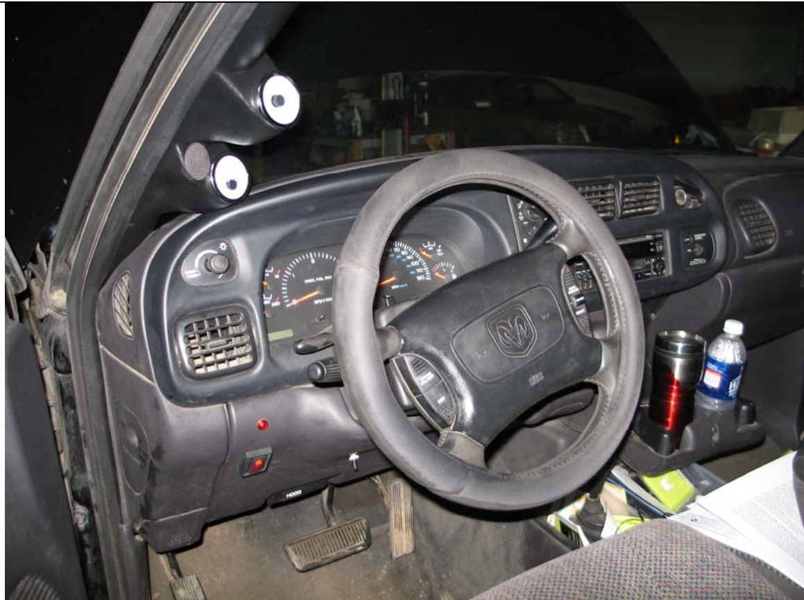
1998 Dodge Cummins – Optional A-Pillar Pod Gauge Mount