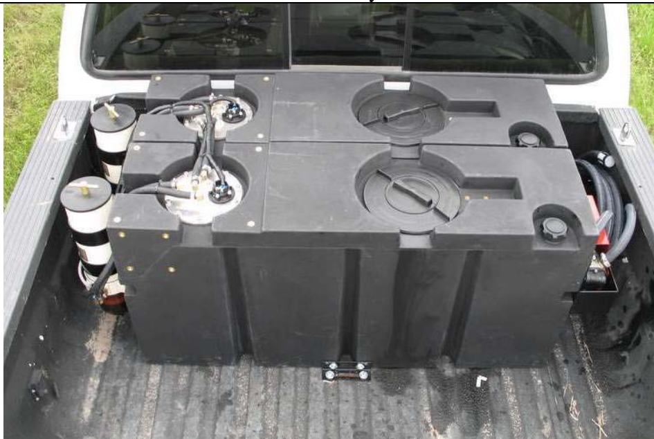
Trekker IOS System