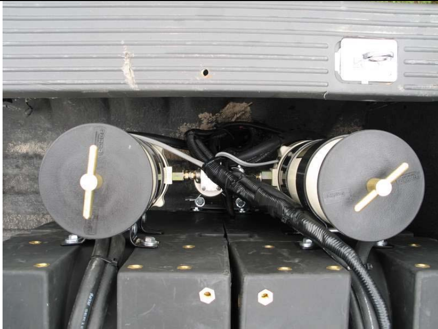
Trekker IOS System – Racor Filters and One Shot Pump