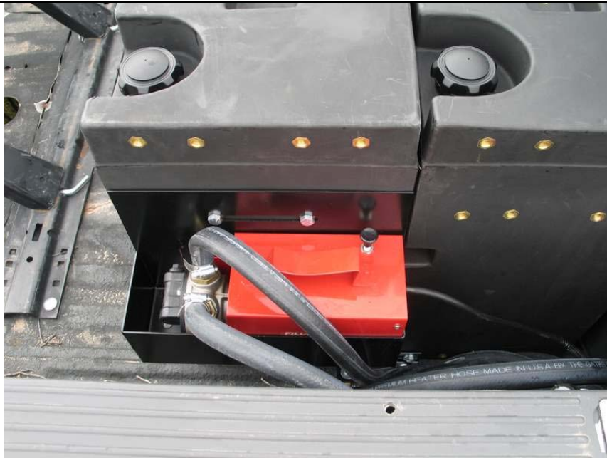
Collection and Transfer Pump