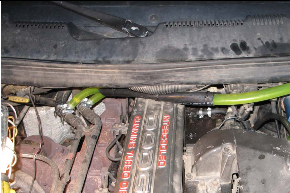
Coolant Tee Splices in Engine