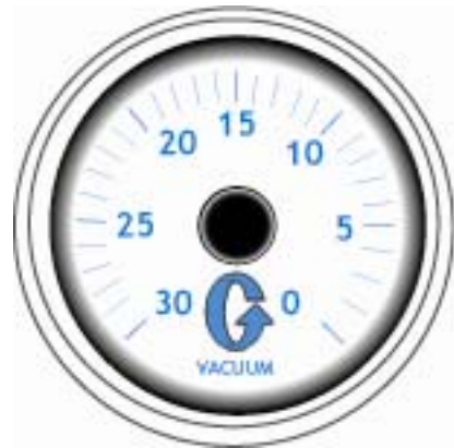
(2500 rpm SVO)