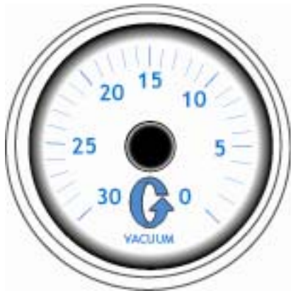
(Base idle, SVO)